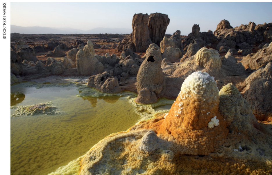
Geoscientists are needed in areas such as Ethiopia's Danakil Depression to study tectonic plates.

NATUREJOBS For the latest career listings and advice www.naturejobs.com